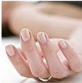
Cure Ringworm of The Nails