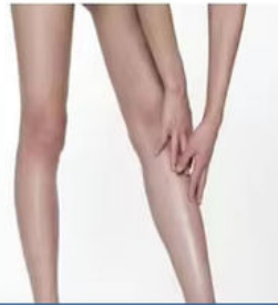
Blood Vein Removal